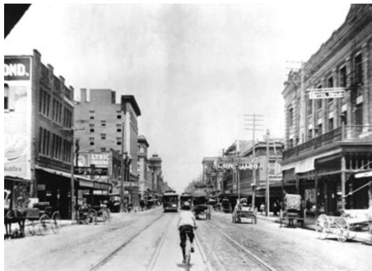
Street scene of Fort Worth, c1900, looking north on Houston Street at 11th Street.