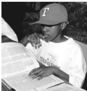
Student reading an 1836 newspaper about the fall of the Alamo.