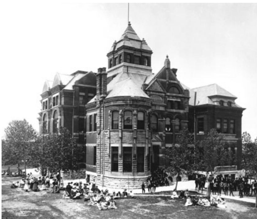
Fort Worth High School, ca. 1900.

was the first studio built in Tarrant County specifically for the photography business and was the state-of-the-art in design for its time. Shortly after the opening of the new studio, the Fort Worth City Council changed the name of the street on which it was located to Photo Avenue.