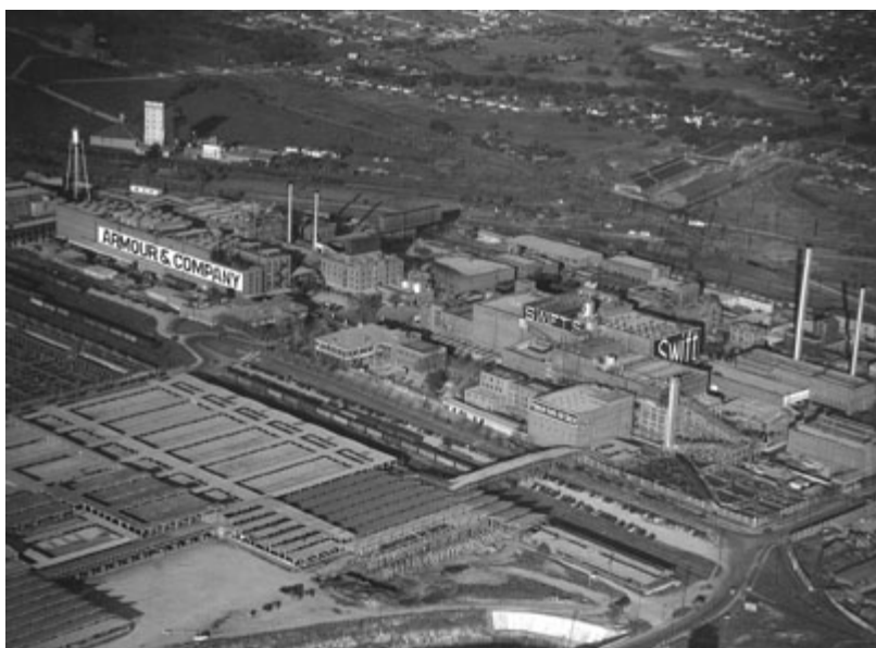
Aerial view of the Fort Worth Stockyards, ca. 1950.