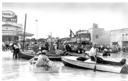
Fort Worth flood of 1949.