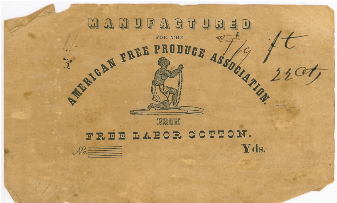
Figure 5. Label, American Free Produce Association.

With more than one hundred people in attendance, the first annual meeting of the AFPA in October 1839 seemed a vibrant but struggling community of dedicated reformers. Delegates celebrated emancipation in the West Indies and the formation of the British India Society (BIS). These events, members claimed, were “calculated to have an important bearing on the cause of freedom generally and on our enterprise in particular.” The delegates passed a resolution to open correspondence with the BIS. While they worried about their lack of progress, the association’s delegates looked forward to the World’s Anti-Slavery Convention scheduled to meet in London in June 1840. The AFPA selected nine delegates — seven men and two women — to represent the association’s