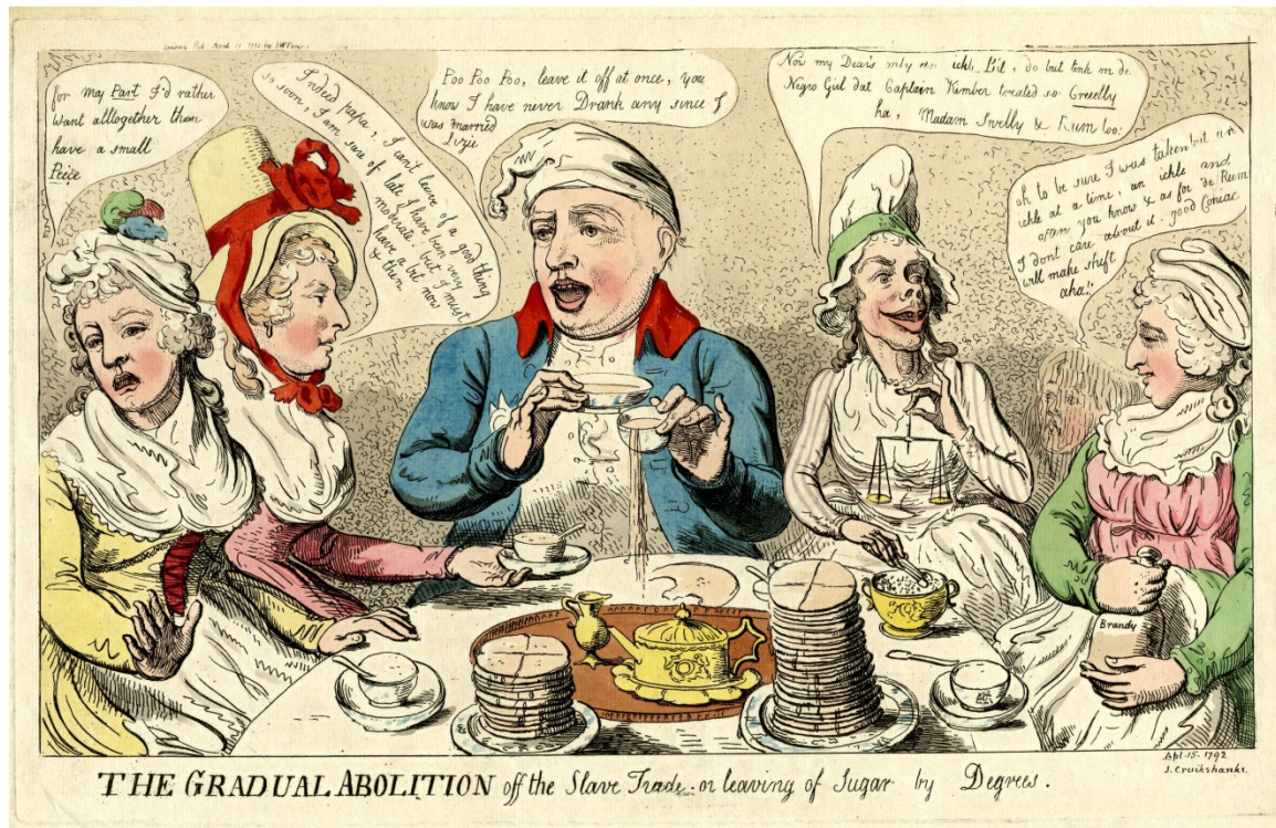
Figure 2. Isaac Cruikshank. “The Gradual Abolition off [sic] the Slave Trade, - or Leaving of Sugar by Degrees,” 1792.

Despite lingering questions about women’s ability to boycott sugar, by late 1791 abstention rhetoric was clearly gendered. Increasingly, tracts and other literature targeted women. For example, one pamphlet attempted to capitalize on the popularity of the new Duchess of York, hoping to enlist her support and bring attention to the abstention movement through a public appeal to her “heart of sensibility.” 64 Newspapers carried