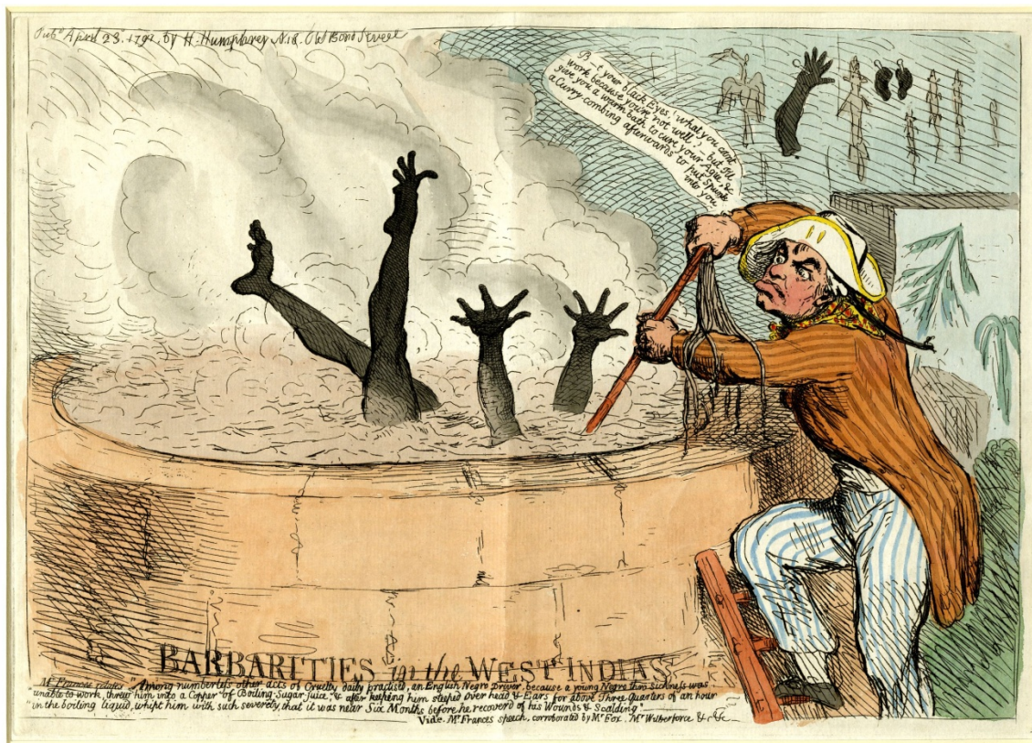
Figure 3. James Gillray. “Barbarities in the West Indies,” 1791.

Contaminated by blood, sugar failed to provide both physical and spiritual nourishment.