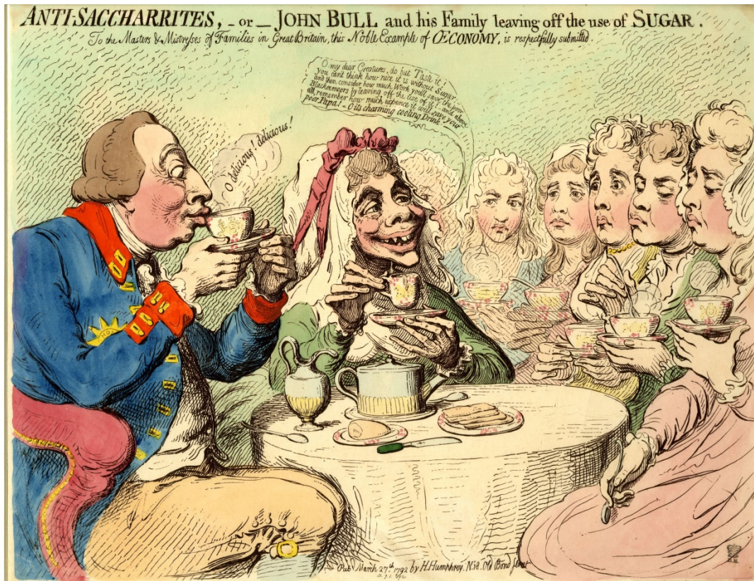
Figure 1. James Gillray. “Anti-Saccharites, - or - John Bull and His Family Leaving off the Use of Sugar,” 1792. Courtesy of British Museum, London.

The second political cartoon, “The Gradual Abolition off [sic] the Slave Trade, or leaving of Sugar by Degrees,” makes similar references to the problematic presence of women at the tea table and in the sugar boycott. (See Fig. 2) Once again, Queen Charlotte’s behavior at the tea table is the focus of attention. Carefully weighing the sugar, the Queen tells Mrs. Schwollenberg, Keeper of the Robes, to take “only an ickle Bit” and to reflect on “de Negro Girl dat Captain Kimber treated so Cruelly.” 63 The