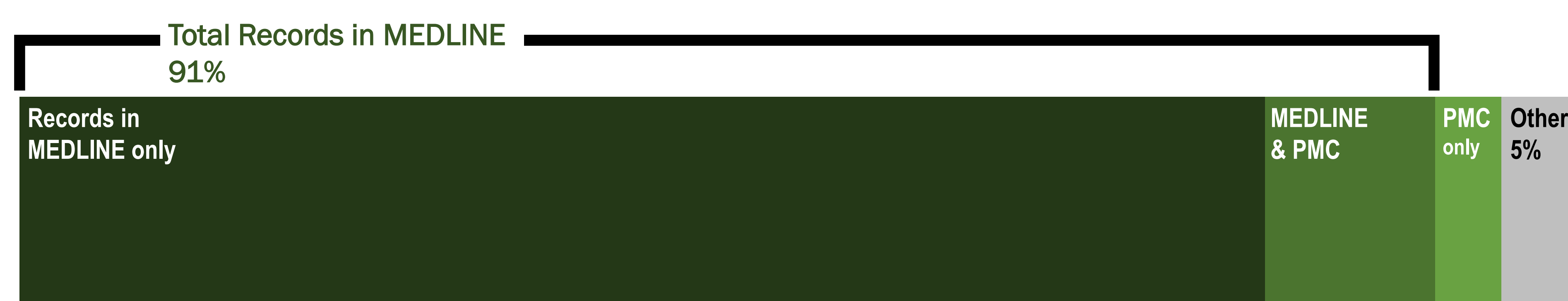
Fig 1. PubMed's Overall Composition, Dec 2017

Questions arose recently about the quality of PubMed, due to PMC becoming a growing component. 3 One area of concern was the potential lack of quality in PMC full participation journals ; another concern was the inclusion of author manuscripts submitted for compliance with national funders' public access mandates. We tested these claims by evaluating MEDLINE-inclusion rates in PMC and PubMed, whether the rates in PubMed have shifted over time, and whether this could be attributed to author manuscript submissions in PMC.