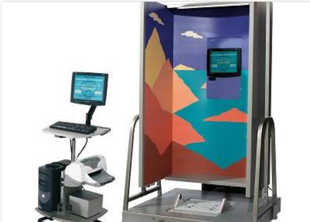
Figure 1. NeuroCom Balance Master Apparatus

with total body composition (Tseng, et. al, 2014). Researchers attributed strength and more muscle mass with driving higher performance in males, while controlling for age, height, and race (Tseng, et. al, 2014). However, this study examined healthy older adults, and did not evaluate for more extensive balance measures or for common ailments in older adults including movement disorders, nor did they collect baseline measures to evaluate change or track such changes over time. While body fat mass could be an important contributing factor, more research in this still needs to be done before defining any causal relationships.