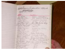
Jan. 19, 1989 - HealthLINE was created from the merger of the Metroplex Council and the Dallas-Tarrant County Consortium. Memberships included both individuals and institutions. The first meeting was held on April 20, 1989.