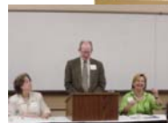
HealthLINE provides a forum for professional development through programs, presentations, & continuing education.