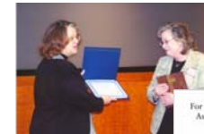
HealthLINE encourages excellence in medical librarianship.