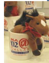
HealthLINE actively supports professional library organizations such as the Medical Library Association and the South Central Chapter of MLA.

Institutional members include: Alcon Research, Ltd. American Heart Association National Center Library Baylor College of Dentistry / Baylor University Medical Center Baylor Medical Center at Garland Baylor University School of Nursing Collin County Community College Cook Children's Medical Center Harris Methodist Fort Worth Hospital Cancer Resource Library Harris Methodist Fort Worth Hospital JPS Health Network Mary Kay Inc. Medical City Dallas Hospital Methodist Health System Parker College of Chiropractic Presbyterian Hospital of Dallas Texas Scottish Rite Hospital for Children University of North Texas Health Sciences Center University of Texas Southwestern Medical Center Veterans Administration North Texas Health Care System