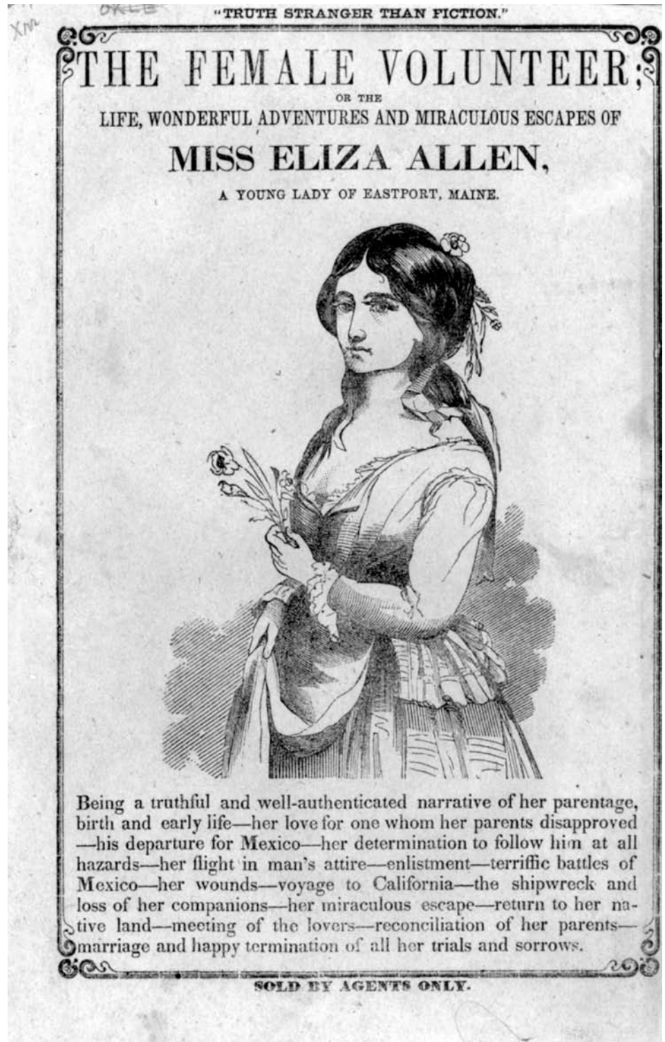
Dime Novel - Miss Eliza at the conclusion of her wonderful adventures.

Story papers echoed nineteenth-century social concerns and their romantic stories were able to challenge conventional genteel values. One subject of public discourse was the right of women to retain control over their property. In the New York Ledger , Craven Le Noir, the dastardly villain in "The Hidden Hand," exclaims,