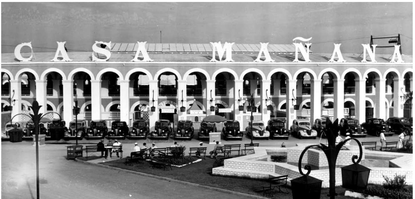
Casa Mañana in 1936.