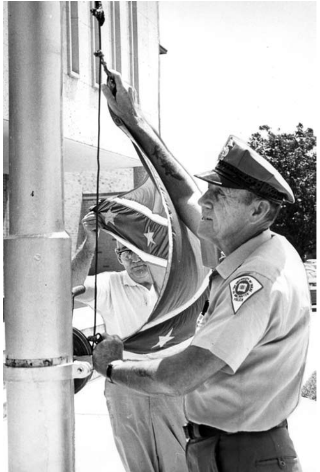
The Rebel flag flew outside the student center until Student Congress decided to permanently remove it. Here, the flag comes down for the last time, June 30, 1968.