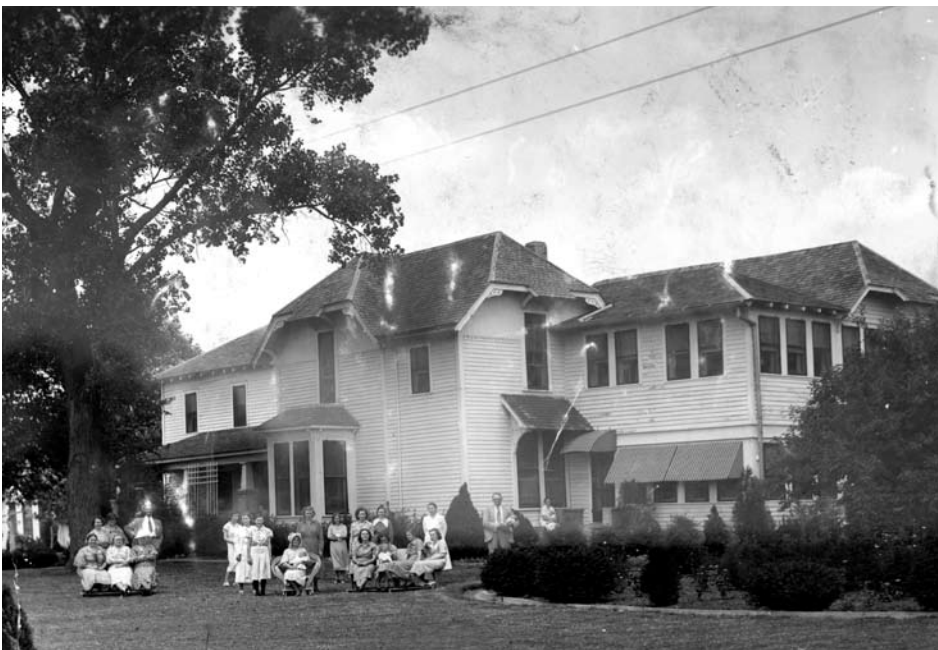
The historic main Rest Cottage building. The facility stood amidst 70 acres of gardens and hay pastures that produced fruit, vegetables, milk and beef for consumption on site.