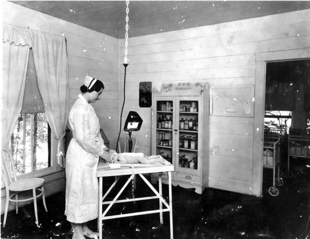
The Rest Cottage delivery room and nursery circa the 1940s.

up to two years for a child. Licensed as a maternity home and child-placing agency by the State of Texas, Rest Cottage case-workers placed their wards with evangelical Christian adoptive couples who not only met state requirements but passed their rigorous scrutiny.