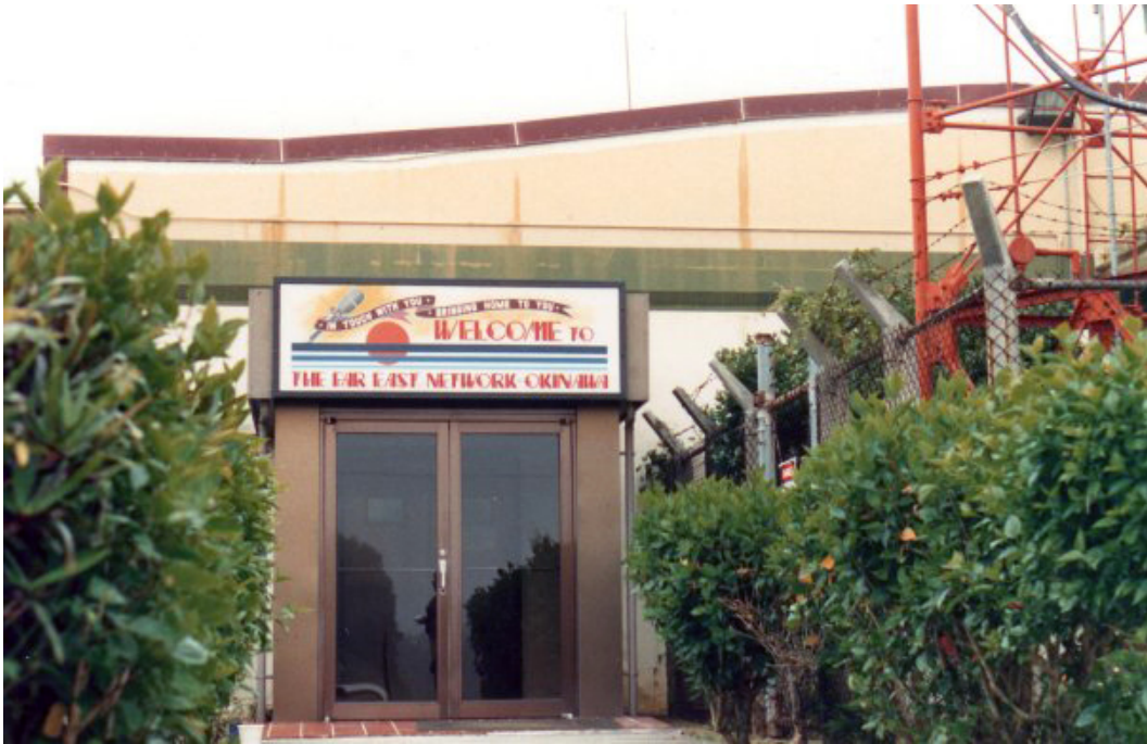
Figure A.1, FEN Okinawa front entrance, 1989