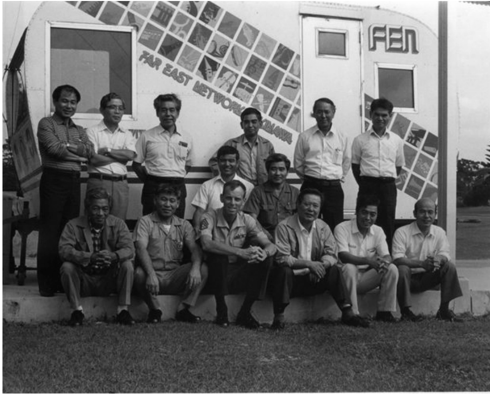
Figure A.10, FEN Okinawa Radio Remote Trailer