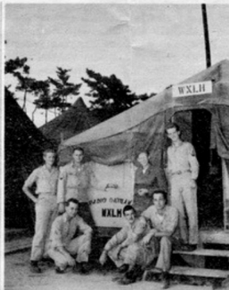
Radio Okinawa staff in front of the scene of their earliest operations.

Of necessity during the days when the war was all around us here on