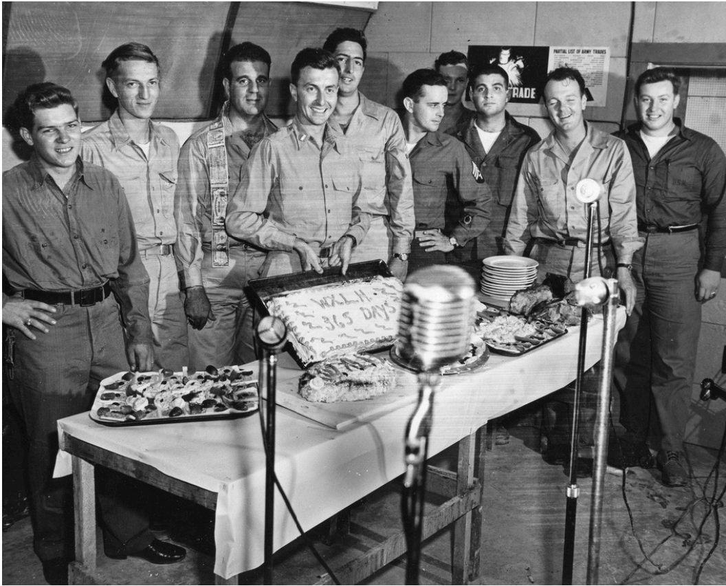
Figure A.8, WXLH 1st Anniversary Celebration