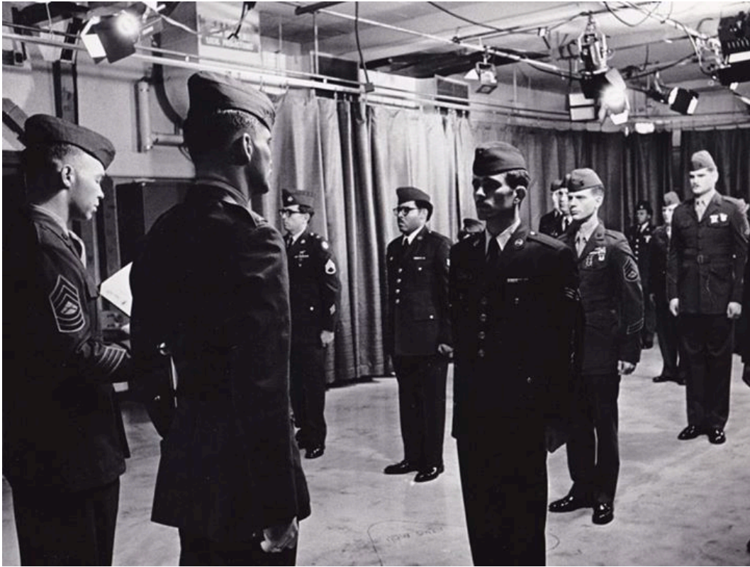
Figure A.9, Quarterly Inspection