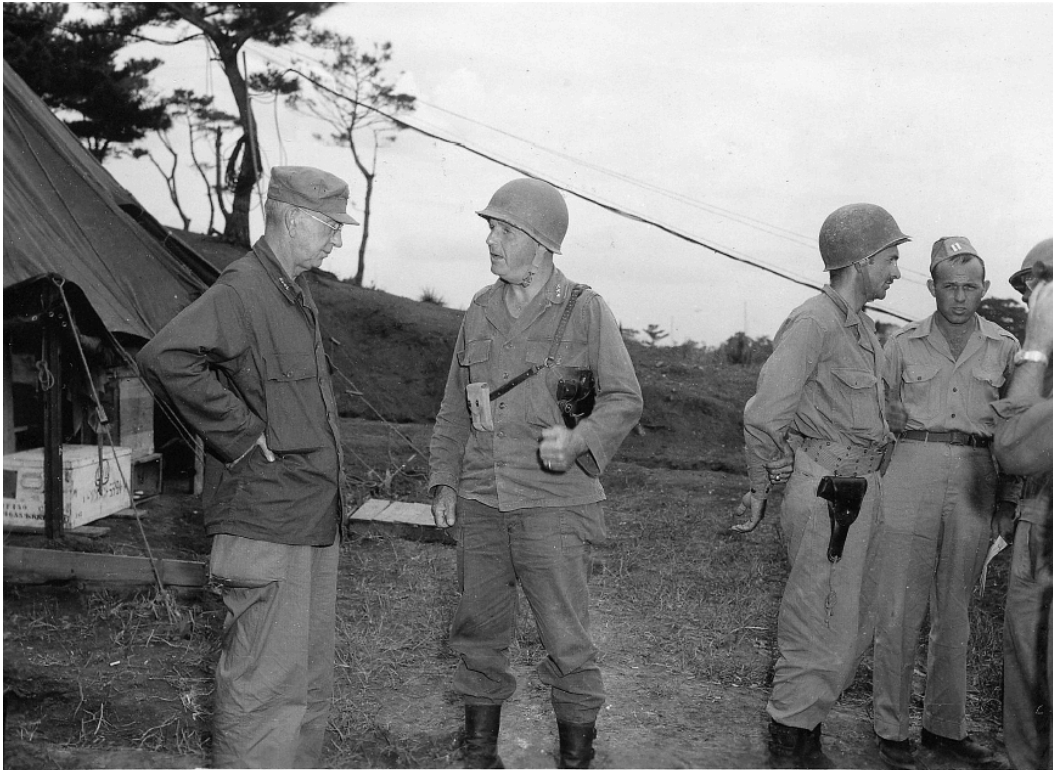
CNCT Neg. No. 247 20 May 1945 Dedication of WXLH; Gen. Buckner & Maj. Gen. Wallace