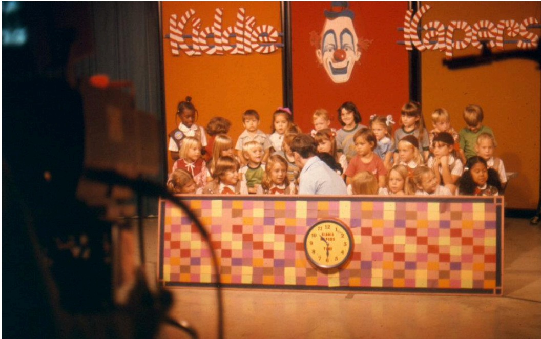
Figure A.13, Set of Kiddie Kapers