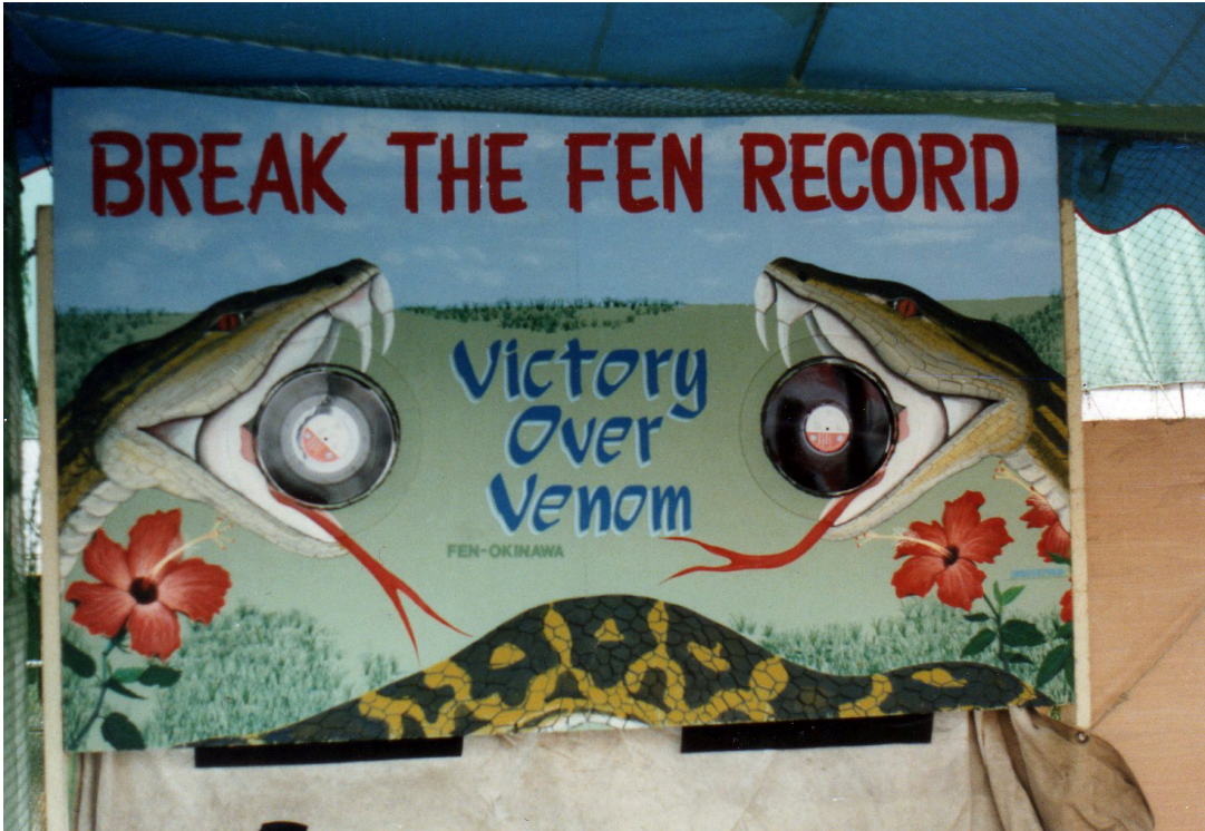
Figure A.12, Record-Breaker Booth