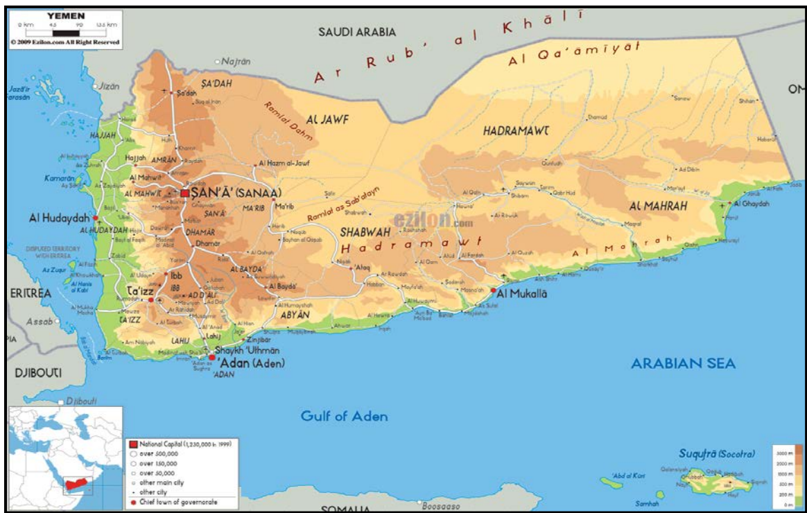
Figure 1.2 Physical map of Yemen

People's Democratic Republic of Yemen, also known as South Yemen was ruled by British for ninety-seven years (1839 -1937) as part of British India Company (Gause, 1988). The company first captured Aden in 1839 and slowly spread their power in remaining territories (Gause, 1988). The National Liberation Front (NLF) and Front for the Liberation of Occupied South Yemen (FLOSY) fought against the British and by 1967 NLF was able to capture most of the territories of south Yemen (Gause, 1988). By 1969 NLF gained all the power in South Yemen and changed the name of the country to People's Democratic Republic of Yemen (Gause, 1988). The two countries finally merged in 1980.