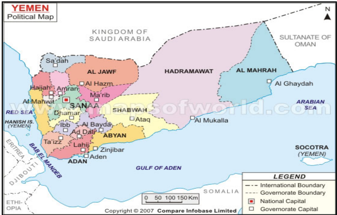
Figure 1.1 Political map of Yemen

YAR later joined United Arab States along with Egypt and Syria between the years 1958 and 1961(Gause, 1988). In 1970, Yemen Arab Republic (YAR) was finally recognized by Saudi Arabia.